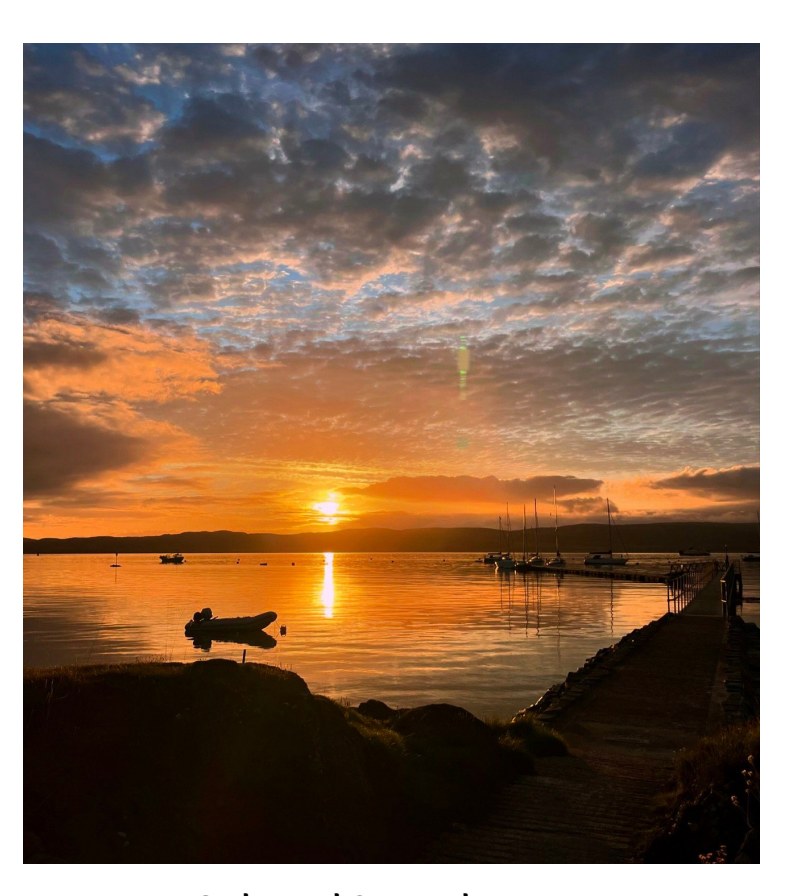
Gigha mid September sunrise